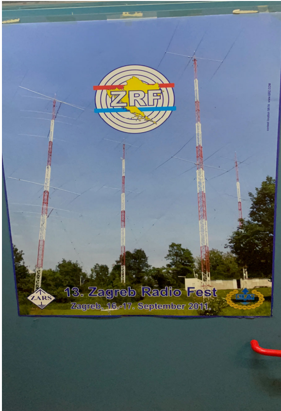
<- Poster of the 9A1A Contest Station