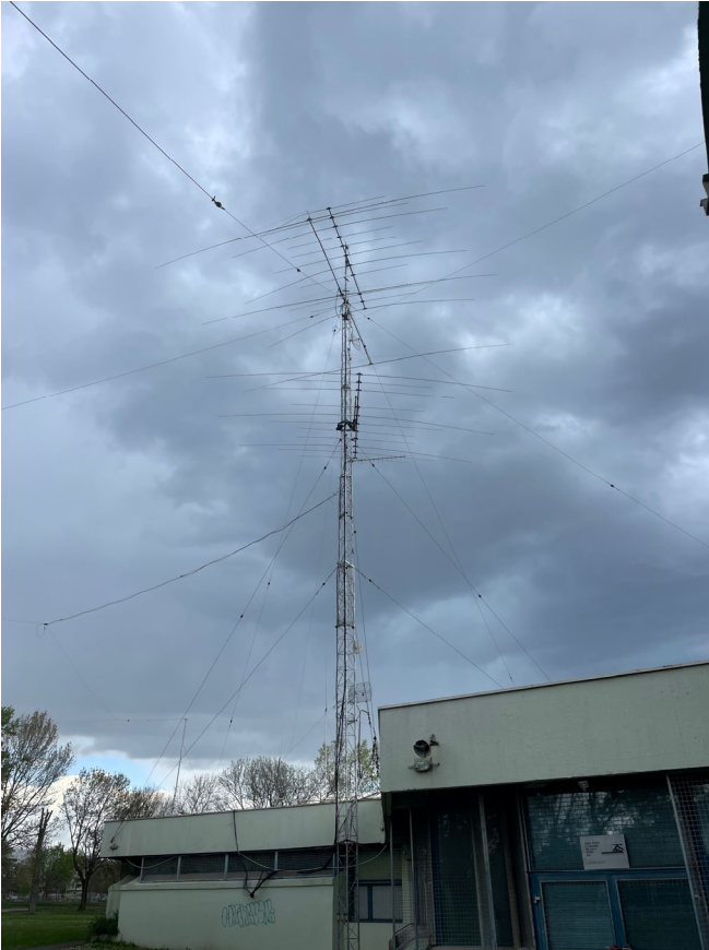
<- Antennas at the 9A1A Headquarters Station

"They are very serious about contesting!" ->